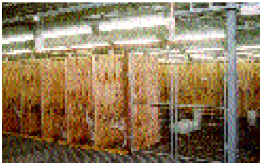
Fallow deer housed in stalls