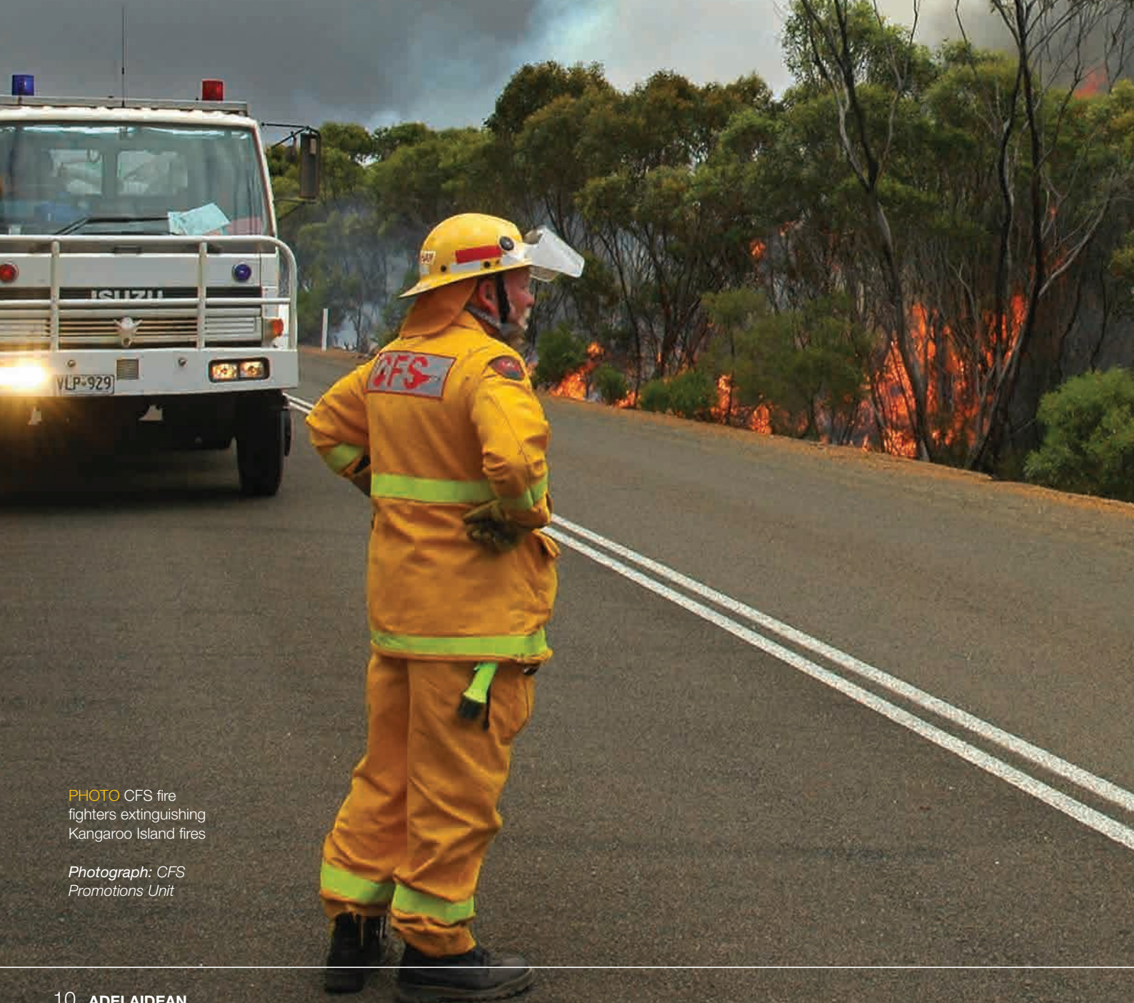
PHOTO CFS fire fighters extinguishing Kangaroo Island fires