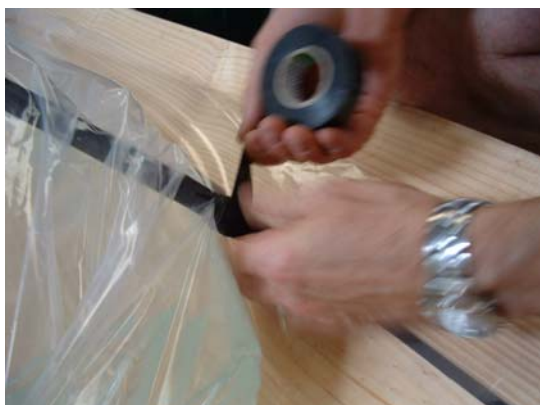
Fig 3 – Gas outlet tube

Spread the layflat tube out in the trench, making sure it is properly centred and the base is laid out flat. It may help to put a couple of centimetres of water in the digester at this point (It will also stop the plastic blowing away!).