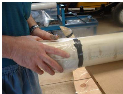
Fig 2 Inlet completed

To construct the gas outlet make a small hole in one of the folds of plastic near the inlet pipe, push the black poly pipe through so the end will sit above water level (the hole should be below final water level) and wrap the area tightly with rubber strip, as in Fig 3, and hold rubber in place with insulating tape.