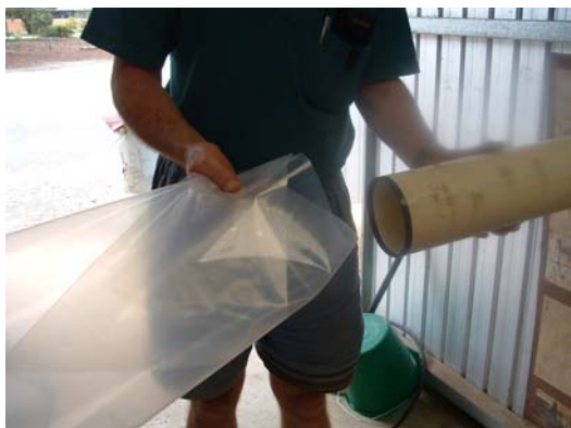
Fig 1 – Folded layflat tube