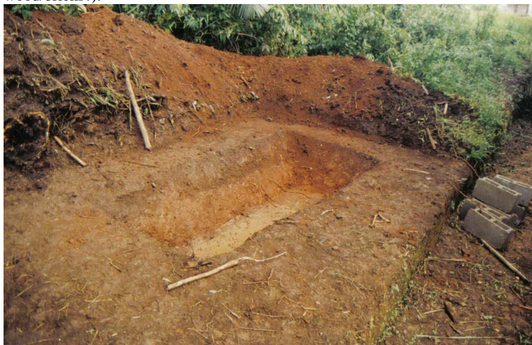
Figure 2 The hole used in Cameroon, a bit deeper than necessary

Mark out the main hole 0.9 m wide and 2 m long (for the standard digester) and excavate to 30 cm deep with 1:1 side slopes to give 30 cm bottom width and 1.4 m bottom length, with a level bottom (if you are on a hill put the digester along the contour). At the inlet end, which can be shaped to support the inlet pipe, make a small area in one sidewall to take the gas outlet (you may need some wood or bricks to hold back the soil) and at the outlet end make a hole that the outlet bucket can sit in (more wood/bricks?).