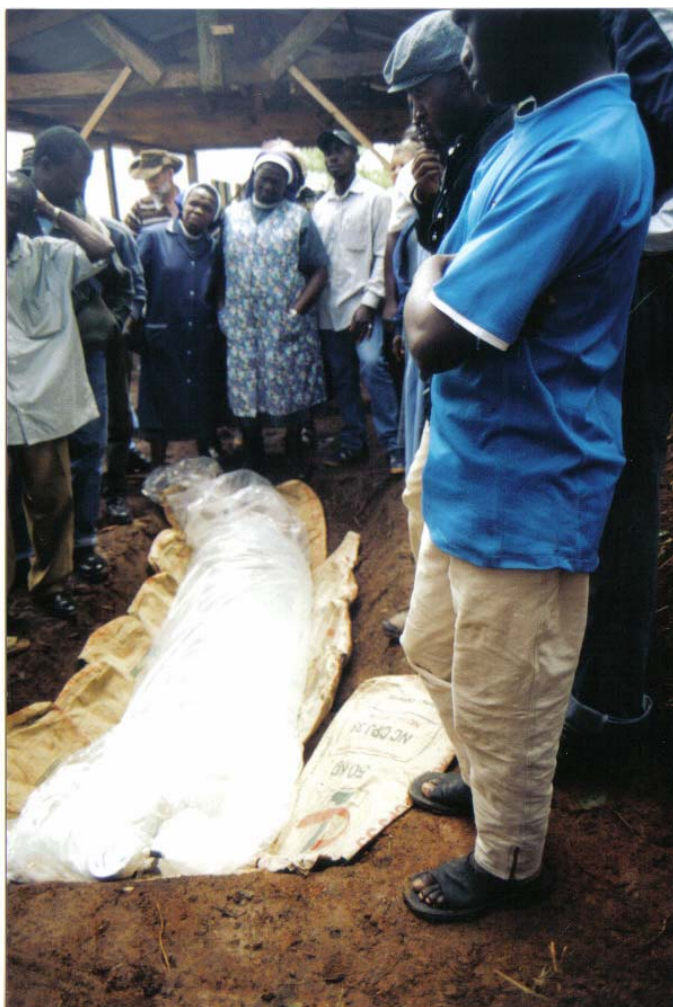
Figure 1 The completed digester in Cameroon