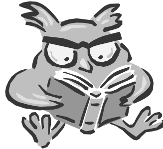
Our gossip, hard at work studying for his next column

Following heterosexuality week will be "Best-iality Week" during which all members of the MSA will be encouraged to experience the Best Sex.