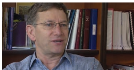
Watch Professor Wayne Meyer on transformational land use bit.ly/wayne2012

The Institute investigates future options for land use by considering environmental, economic and social implications. This research looks at how to protect agricultural profitability while repairing biodiversity and answering climate change adaptation imperatives.