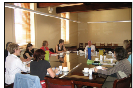
The forum was sponsored by the University of Adelaide, UniSA and Flinders University