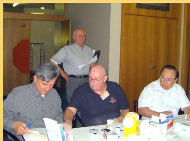
Final data collection session: Week 12

I thoroughly enjoyed the experience of being a peer-leader for the GIRTH program and in watching the group dynamic unfold. It was particularly gratifying to see quieter, more reserved group members open up to their fellow participants as the weeks progressed. Being a co-ordinator was a privilege, not a chore and I would have no hesitation in participating again in GIRTH.