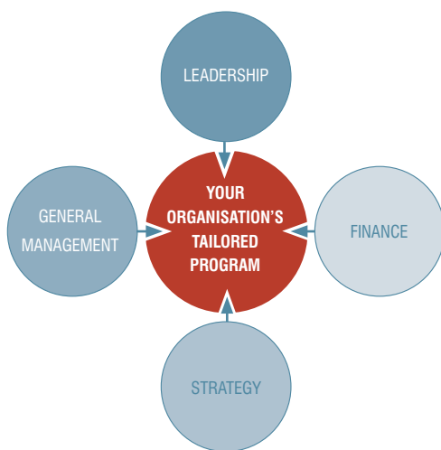
Elements of a tailored program