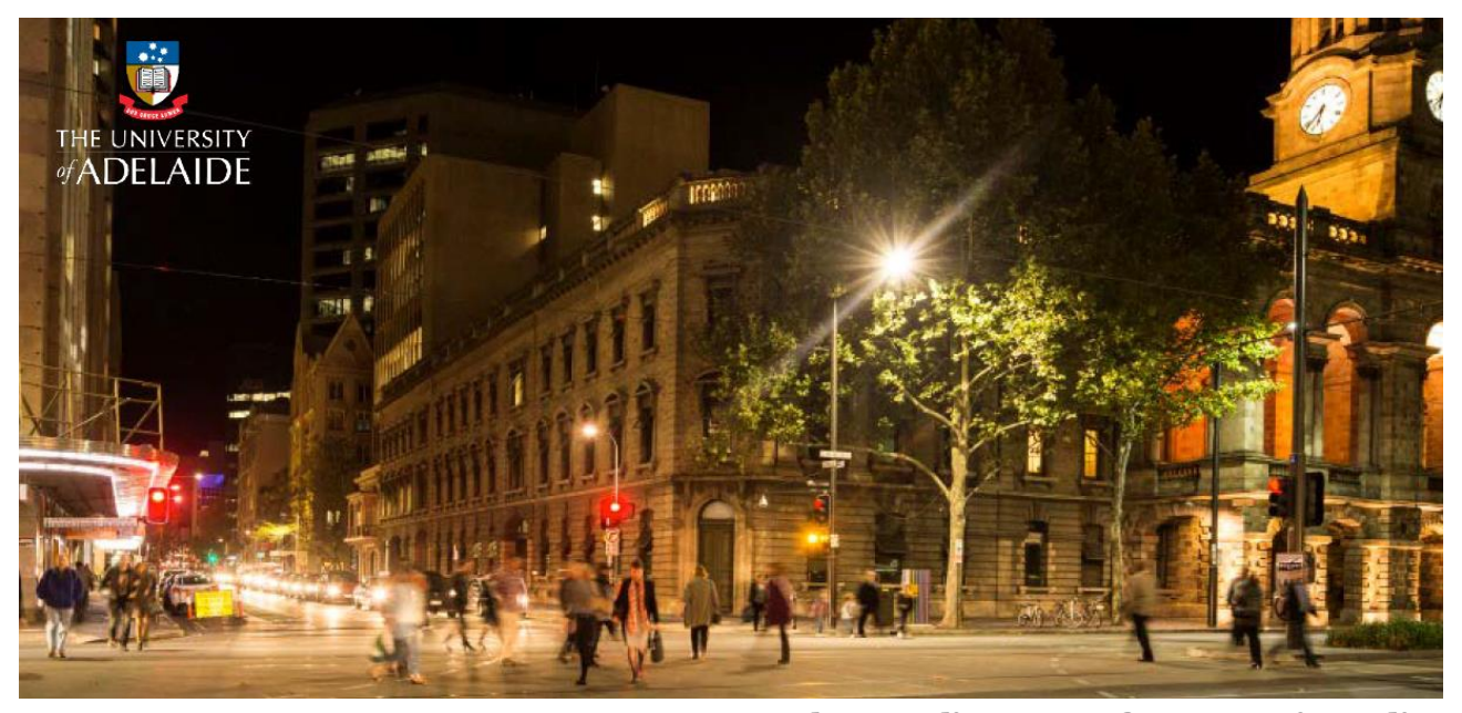
South Australian Centre for Economic Studies