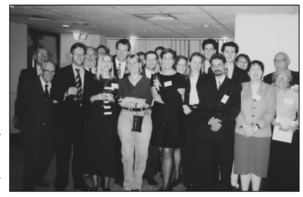
Some of the Adelaide alumni at the Melbourne reception on 25 March.

A Melbourne Chapter will be formed to strengthen the Association's ties with alumni living in Victoria. This group will be able to assist in organising an annual Alumni Reception and other events of benefit to the University and its alumni