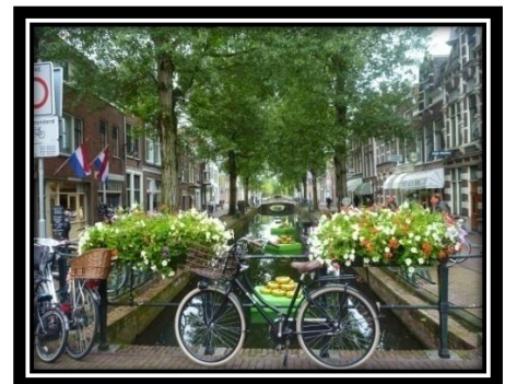
Amsterdam, The Netherlands