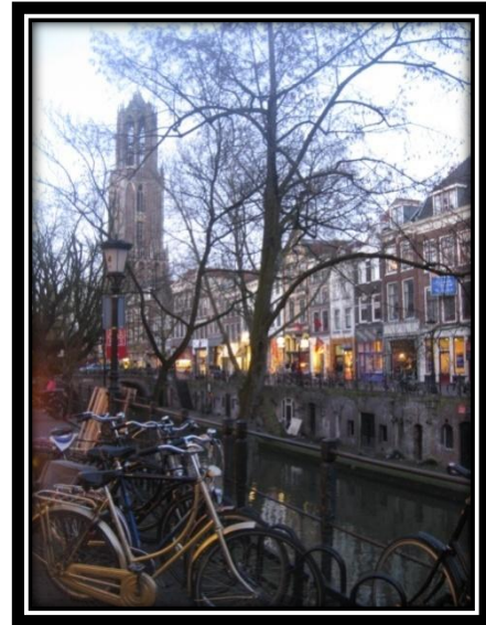
Utrecht, The Netherlands