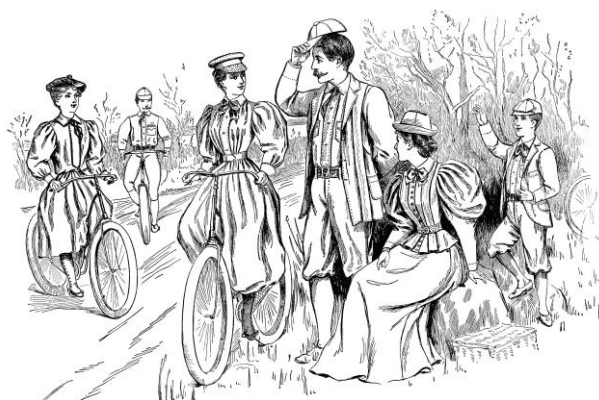
BICYCLING AND BICYCLE OUTFITS.

Please aim to keep carry bags to a minimum. While in the house, students' belongings (“luggage” in 1892) such as bags, drink bottles and school hats will be stored until the end of their visit.