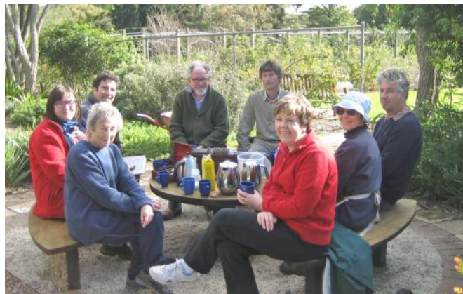
MGS working bee participants enjoying a well-earned 'cuppa'.

On June 23 the Mediterranean Garden Society held another working bee in the Garden of Discovery and planted 40 donated plants including Dianella caerulea 'Cassa Blue', Correa alba , Themeda australis (kangaroo grass), Doryanthes excelsa (Gynea lily) and Goodenia species.