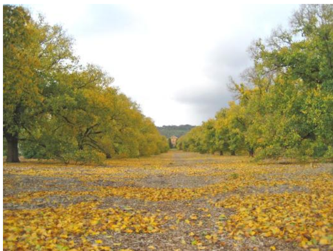
Elm Avenue

Elm Avenue is slowly turning its lovely lemon yellow autumn colours. With recent rains and cool nights a variety of fungi are fruiting including the toxic Death Caps and signs warning not to pick or eat any fungi in the Arboretum have been posted on every gate.