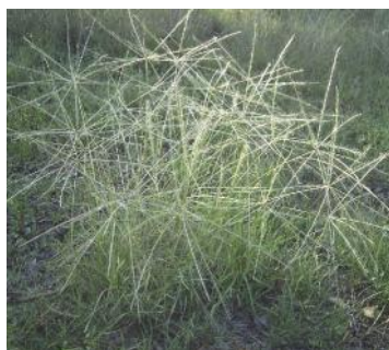
Chloris truncata , windmill grass.

Besides their aesthetic appeal, the advantages of perennial native grasses are that they are deep-rooted which assists water infiltration and enables them to remain green in summer reducing fire risk, maintain soil cover and improve the health of the soil. Windmill Grass Chloris truncata which is a hardy, C4 summer-growing, tussocky species is an excellent coloniser of disturbed and compacted soil and being low-growing requires little mowing. It is ideal for the Arboretum and a substantial patch has established around the oak collection (G13) where its vigorous growth has excluded the broad-leaved weeds. It has continued to flower through autumn and into winter. Each inflorescence produces plentiful small seeds which disperse readily and germinate rapidly.