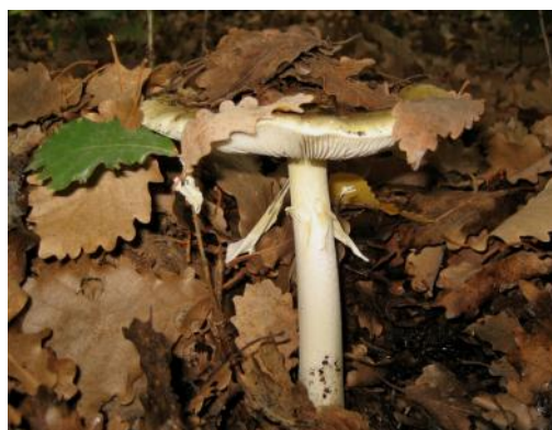
Death caps, Amanita phalloides.