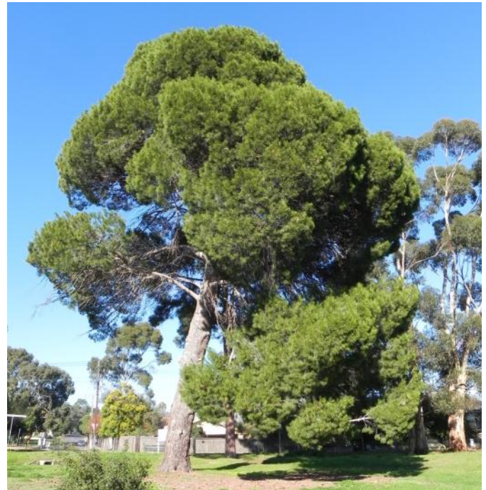
P. halepensis near gate into Claremont Avenue.

Others of similar appearance dating from the same time appear at Urrbrae Agricultural High School and at Carrick Hill. All of these bear overabundance of cones too. The Arboretum is fortunate in having an exceptionally good tall specimen planted in 1929,