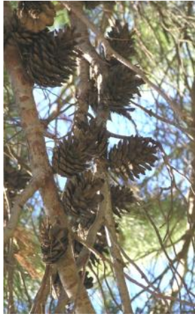
Heavy crops of cone and seed.

replacement with Pinus radiata ). The main trunk forked often several times in many of them and there were no vertical trunks, all bending at the base before reaching near upright shape, but usually over-compensating into an elongated S-shape.