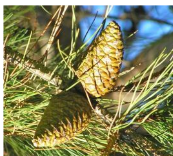
P. halepensis cone (L) parallel to branch and pointing to root of branch. and P. brutia cones (R) at right angles to branch.

The most visible distinction between Aleppo and Brutian Pines is the markedly different angle between the cone and the main axis of the branch and this is not apparent until cones are well-developed (about one year after flowering and pollination occurs). Cones usually form in pairs, 3s or 4s. In P. halepensis the stem of the cone elongates and curves so that the cones lie parallel to the branch 1 , pointing towards the root of the branch: in P. brutia cones develop almost stem less (sessile) and point out at right angles. Flowering does not begin until the eighth year, in open grown individuals and is later in trees in closed stands. The