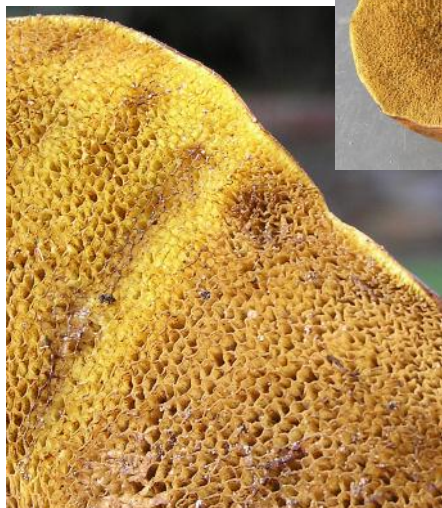
Underside of one of the fruiting bodies showing tubular structures which contain the spore producing cells.

The mycorrhizae have been growing in harmony with trees for millions of years and improve a tree's ability to survive particularly in periods of stress, e.g. drought, but they also provide the tree with a protective function. This may arise because the mycorrhizae are able to outcompete pathogenic fungi and create an inhospitable environment for disease causing fungi to colonise roots (Moore, 2011).