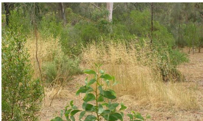
Native grasses in the North West revegetation area