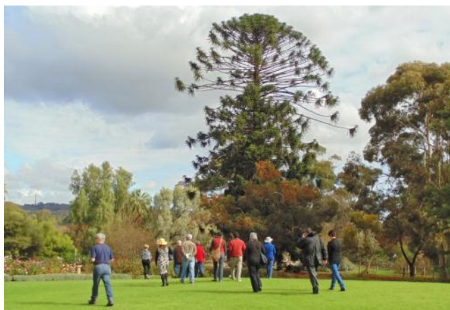
Guide Jenny Birvé leading visitors to the Bunya pine.

Each guide took a different approach to the topic: The fascination of plants . Jenny showed her group some of the trees that were flowering. The mallee section was alive with rainbow lorikeets and native noisy miners feeding on the nectar. E. megacornuta , Warty Yate with its bright green flowers, the grey buds