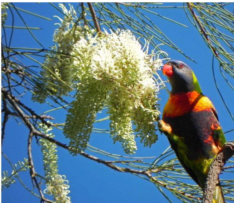
Hakea fraseri, Corkwood Oak and rainbow lorikeet.