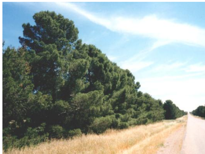
Pinus halepensis planted in 1962 at J. Hill's property, south of Maitland. Trees were 18 years old when the photo was taken.

year. They germinate readily and succeed where there has been ground disturbance and burning. In rural areas ploughing and burning off are frequent bushfire prevention practices and this has allowed the pines to invade roadside verges and cause problems for rural Councils.