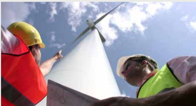
CRICOS PROVIDER 00123M

The Adelaide Wind Tunnel is located at the University's Thebarton Campus, Stirling Street Thebarton, 4 km from the Adelaide CBD and 6km from Adelaide Airport.