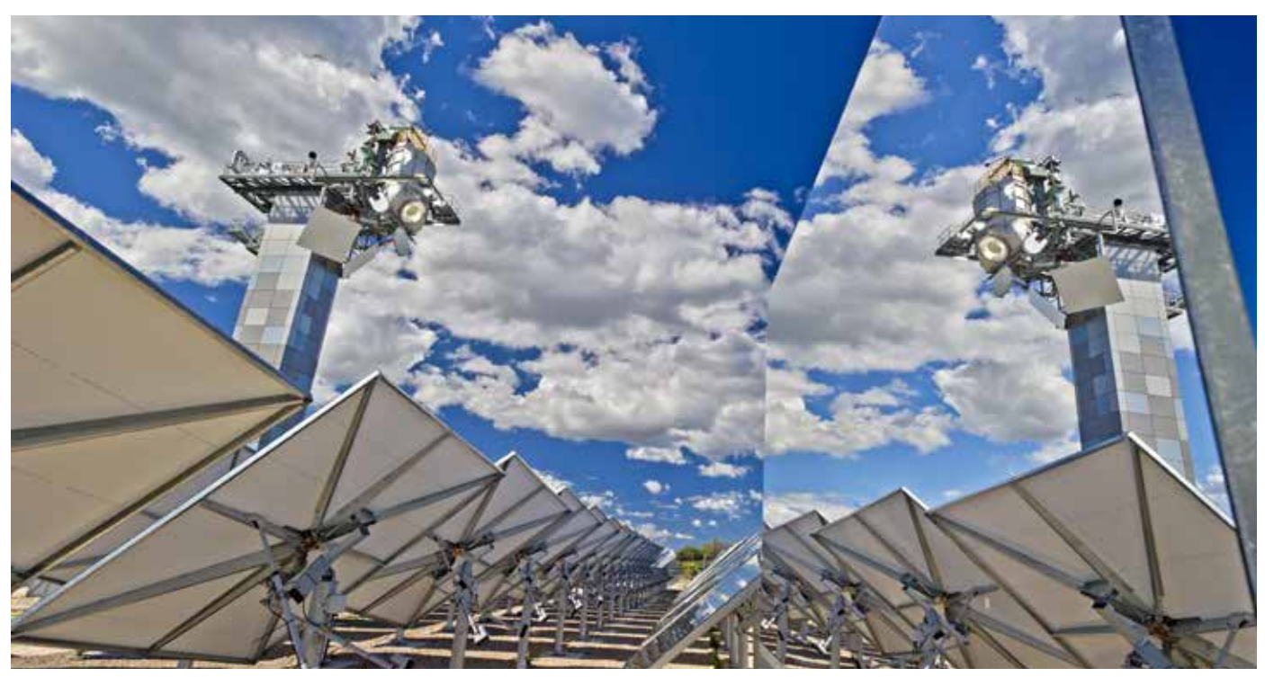
ASTRI Solar Tower

CET is developing new technologies to replace the long-term need for low-carbon liquid fuels for air transportation, heavy freight and agriculture. It is partnering with Muradel - a spinout from the University of Adelaide, Murdoch University and SQC - to develop commercialscale hydrothermal liquefaction of sustainable wet feedstock including biosolids and algae to produce biocrude-oil. Tests are being performed both in our laboratories and at Muradel's pilot-scale facility in Whyalla, South Australia. This work complements the ASTRI program, in which we are targeting low-carbon Fisher-Tropsch liquids produced by the solar gasification of dry solids including forestry waste and the residues from agriculture and bio-refineries.