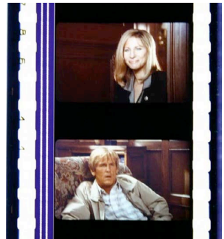
Modern 35mm Agfa print of The prince of tides (1991) with Barbara Streisand and Nick Nolte, showing the blue soundtrack.