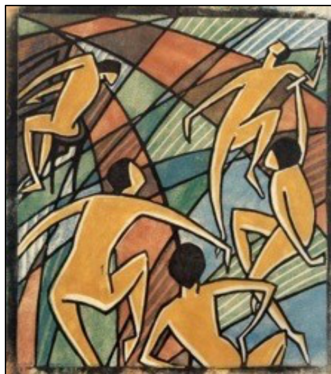
Dorrit Black, Australia, 1891–1951, Music , 1927/28, Paris, colour linocut on paper, 24.1 x 21.2 cm (image). Elder Bequest Fund 1976, Art Gallery of South Australia, Adelaide.