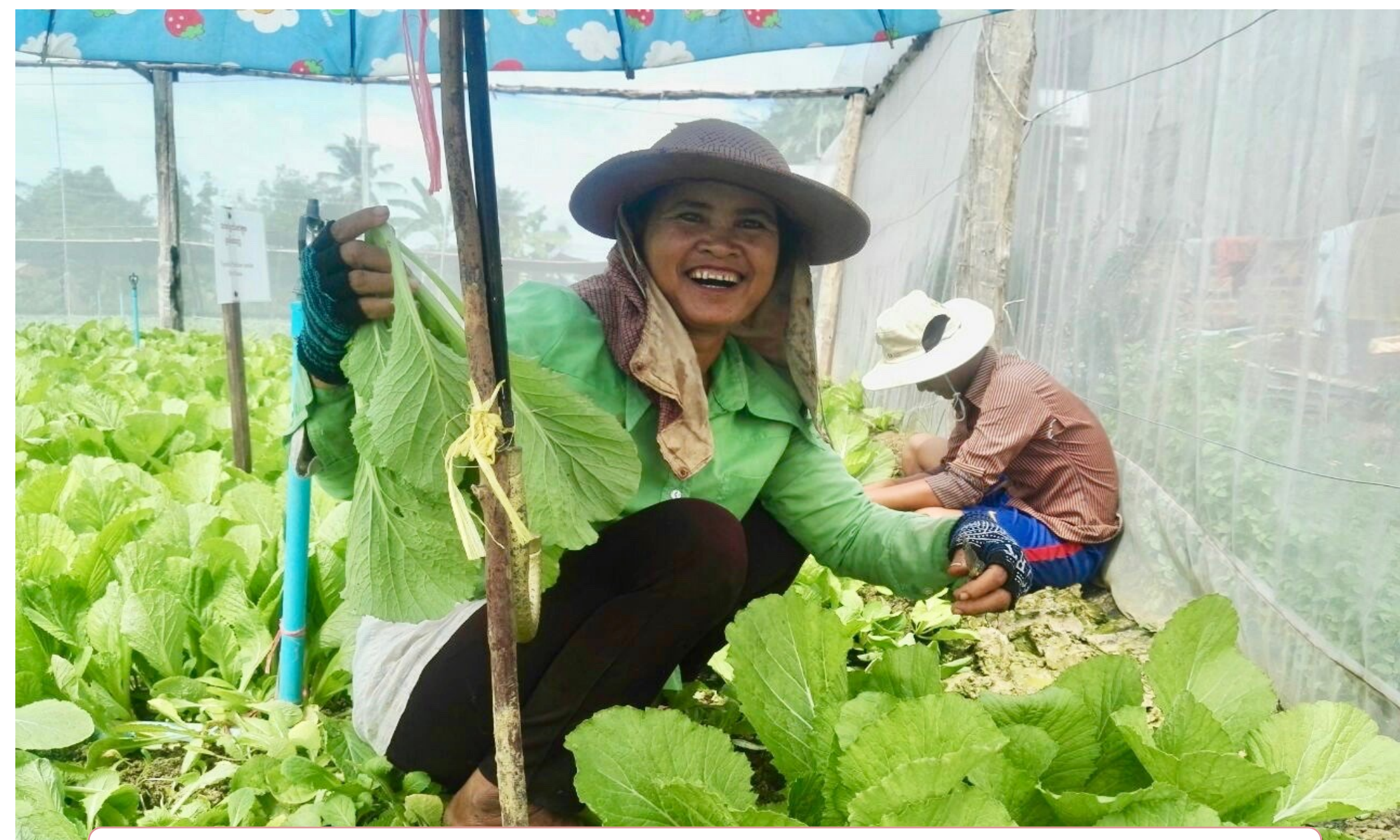
Happy Farmer with Good Quality of Green Mustard