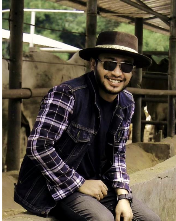
Oji SNV Netherlands Development Organization