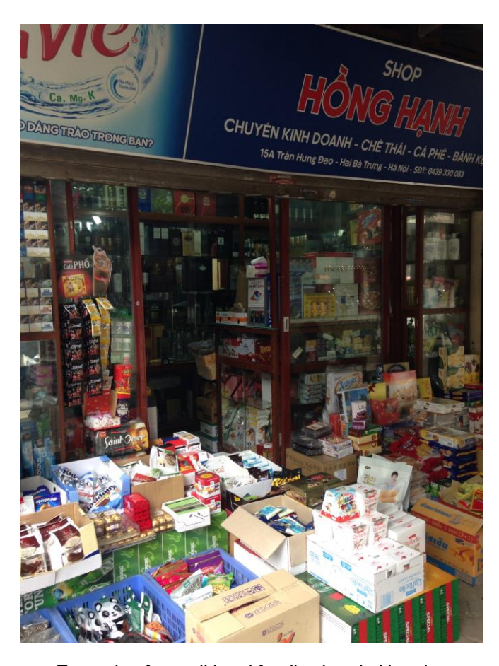
Example of a traditional family shop in Hanoi.

Other factsheets in this series provide further insight on purchasing patterns of specific types of vegetables (Factsheet 9), fruits (Factsheet 10) and meat products (Factsheet 11). In particular the impact of household income on purchases of specific food products is further explored.