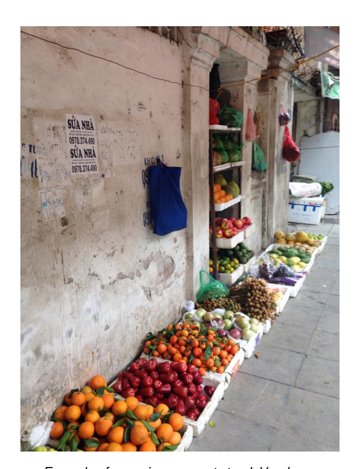
Example of a semi-permanent stand. Vendors can move around but tend to set up in one location for the day.