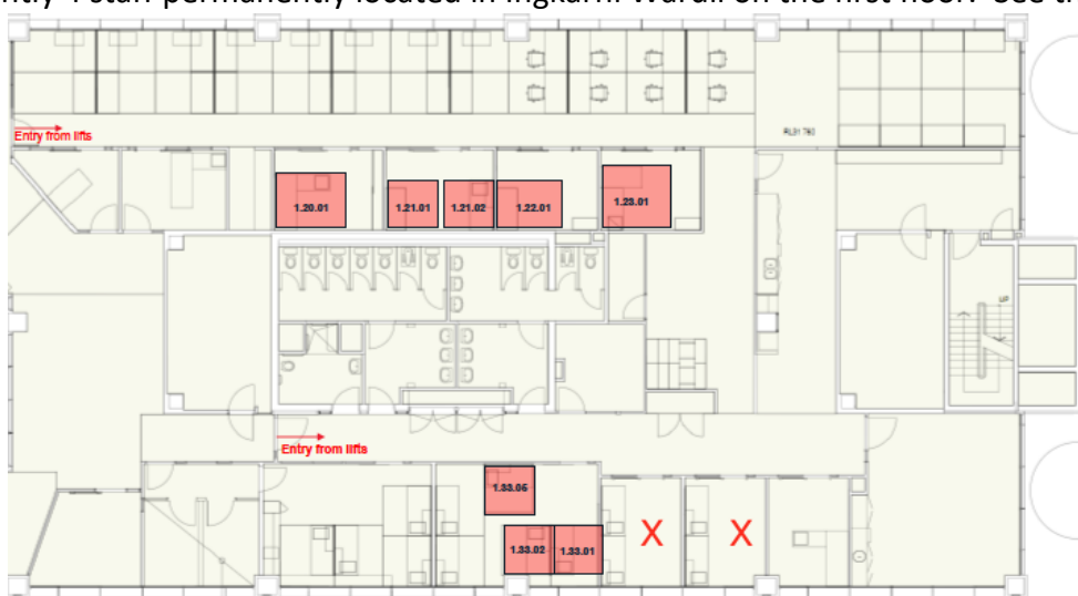
Map 1 Ingkarni Wardli level 1

There are currently 4 staff permanently located in Ingkarni Wardli on the first floor. See the red X in the picture below.