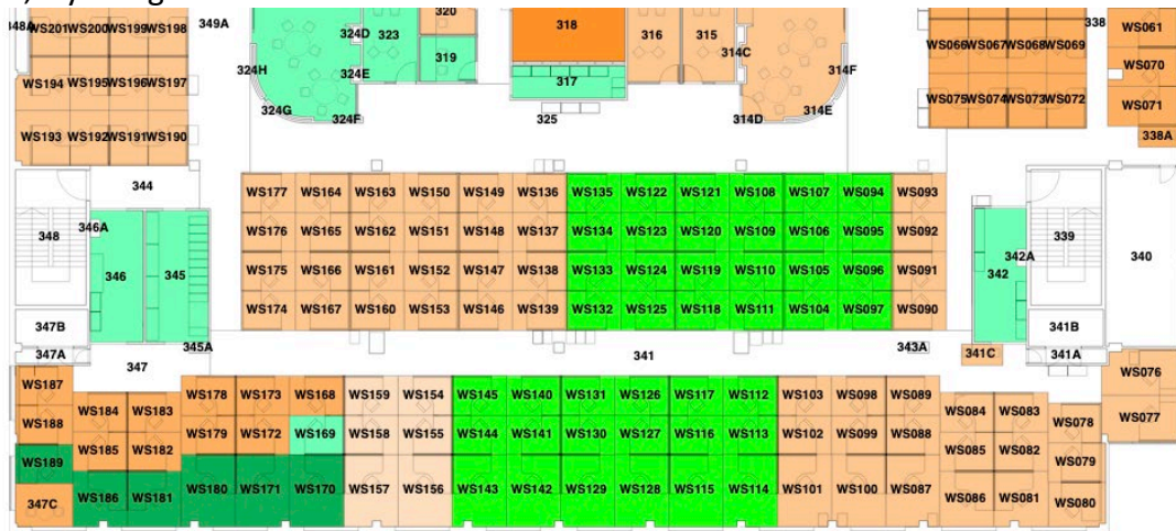
RUNDLE MALL PLAZA - 44-60 RUNDLE MALL (RMP-NT72) THIRD FLOOR

The simplest way for areas to do this is to use UniSpace . This website will allow you access to up-to-date floor plans with the ability to add room numbers and colour coding to identify rooms and workstations that need to be entered and tested by technicians. The default colours of departments can be changed, and we suggest you use Fluro Green to mark your area. If you have any trouble using UniSafe with your usual browser, try using Firefox.