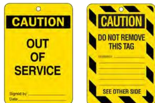
Example of an “out of Service” tag

Tags can be purchased from Facilities Management Maintenance North Terrace Campus, or areas Schools/Branches can source tags from external suppliers.