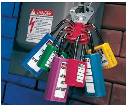
Figure 1: Multi-padlock hasp