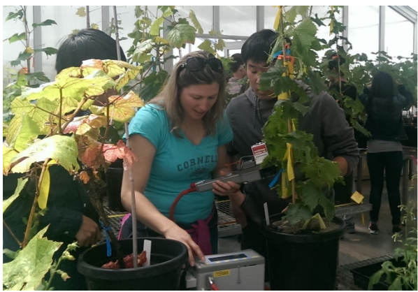
Students and mentors working in the glasshouse