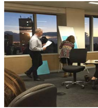
Faculty of Health Science SGDE Co-Creation Workshop 2 August 2016