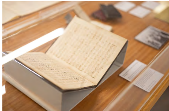
Stories from the Archives, from Foundation to Federation exhibition

The exhibition was held as part of the South Australian History Festival. It showcased a selection of documents from the State Records of South Australia and the Library’s Special Collections from the time of the first European settlement to Federation in 1901.