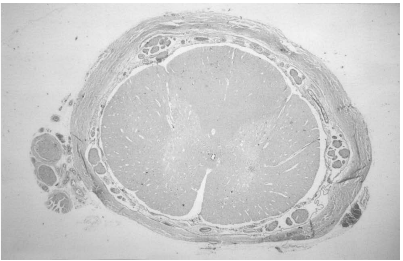
Figure 1: Transverse section of the spinal cord

Q1 Figure 1 shows a transverse section of the spinal cord stained with H&E. A colour version of this image is available on the monitors. Figure 2 is a diagrammatic representation of a segment of the spinal cord.