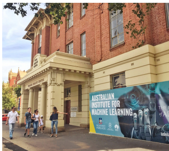
Image: In December, Computer Science and AIML moved 140 staff and students into their new flagship premises as anchor tenants in Lot Fourteen.