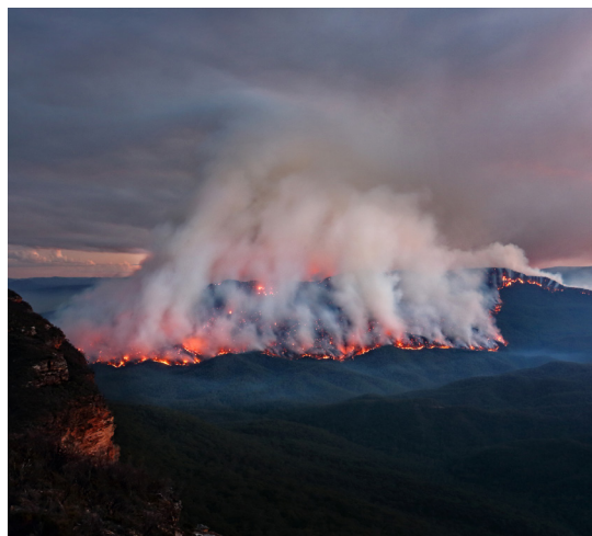
Image: The EI has been assisting with the UoA's response to the bushfires including with capability statements, roundtable meetings, engaging new members and providing support to access relevant funding.