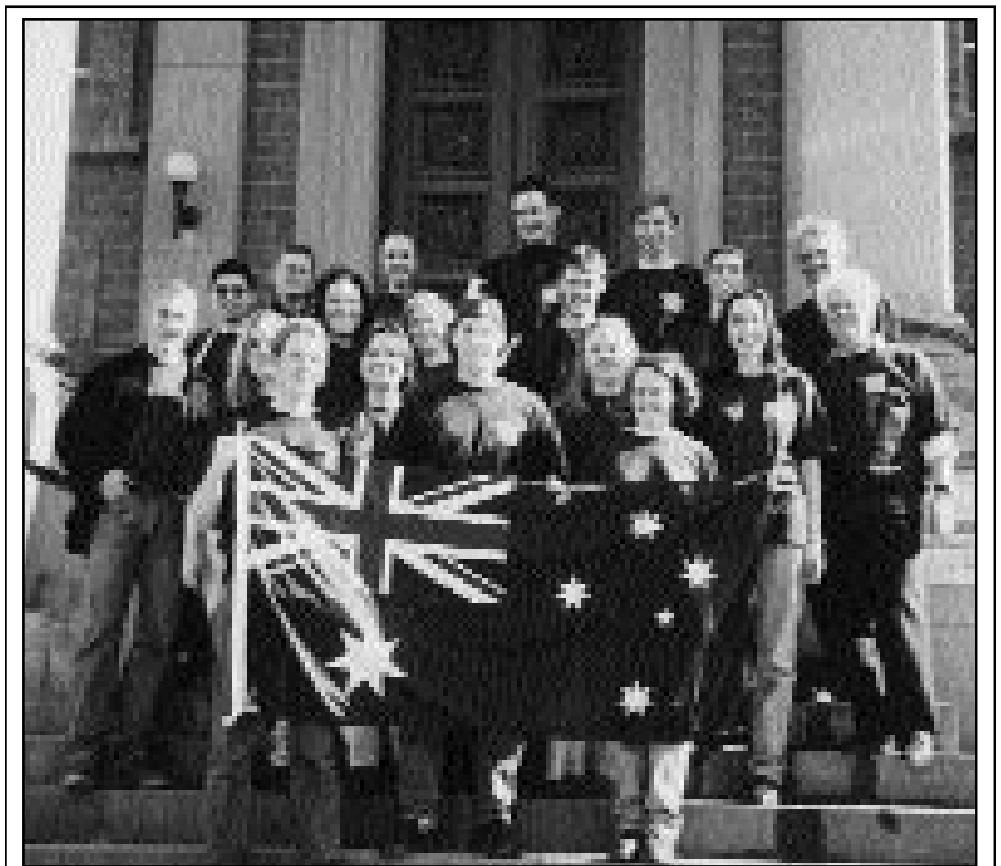
This group of Architecture and Urban Design students has flown to Vietnam to begin 12 weeks of study at the Hanoi Architectural University. In all, 19 students from the University of Adelaide are taking part in the study trip — the first of its kind for the Faculty of Architecture and Urban Design.

During their stay the Adelaide students will work on two major design projects, centred on old and developing areas within Hanoi. The students will receive full credit towards their degree for the studies undertaken in Hanoi.