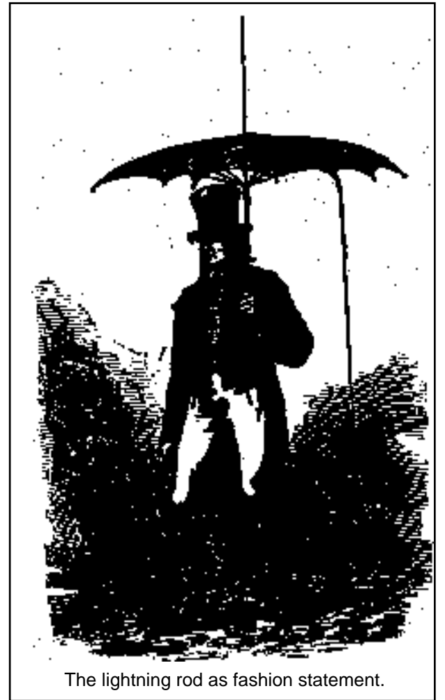
The lightning rod as fashion statement.