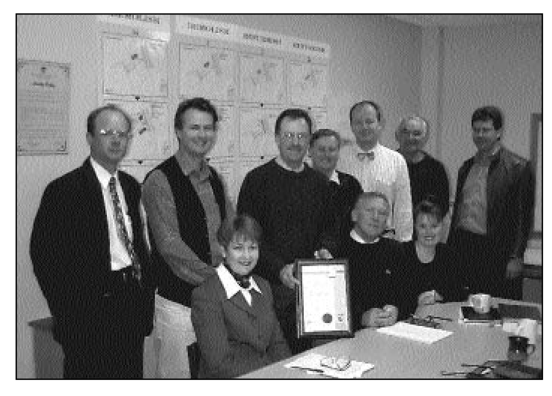
The successful team in the Projects Division display their ISO 9002 quality certification.