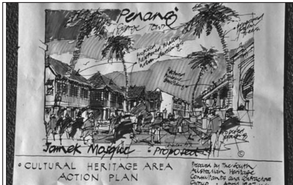
Proposed streetscape treatments outside the Masjid Kapitan Keling Mosque, George Town, Penang.

The project, supported by Penang's state Ministry of Tourism & Culture and the Municipal Council of Penang Island, is being undertaken through PDC-AR&T Total Project Managers Sdn Bhd.