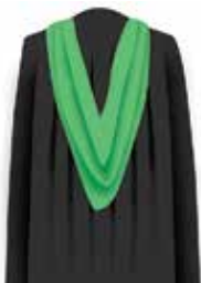
Creative Arts and Architecture Cendre Green

Graduates receiving a Professional Doctorate, PhD, Higher Doctorate, Doctor of Medicine or a Doctor of the University wear a bonnet of black velvet.