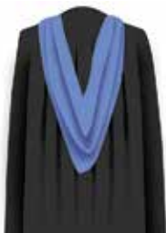
Business Helvetia Blue