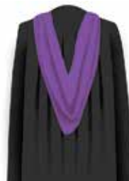
Engineering and related technologies True Purple