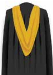
Natural and Physical Sciences Primuline Yellow