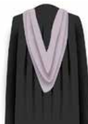
Society, Culture and Education Pale Violet Grey