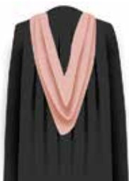
Health Sciences Eosin Pink