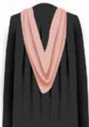
Health Sciences Eosin Pink