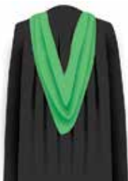
Creative Arts and Architecture Cendre Green

Graduates receiving a Professional Doctorate, PhD, Higher Doctorate, Doctor of Medicine or a Doctor of the University wear a bonnet of black velvet.