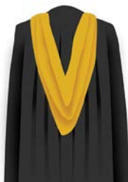
Natural and Physical Sciences Primuline Yellow