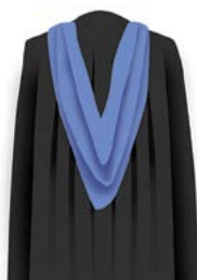
Business Helvetia Blue