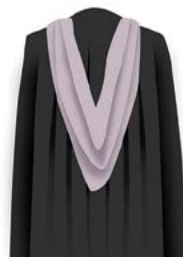
Society, Culture and Education Pale Violet Grey