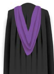
Engineering and related technologies True Purple