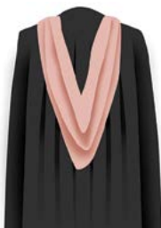
Health Sciences Eosin Pink

Graduates receiving a Professional Doctorate, PhD, Higher Doctorate, Doctor of Medicine or a Doctor of the University wear a bonnet of black velvet.