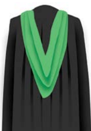
Creative Arts and Architecture Cendre Green