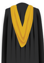
Natural and Physical Sciences Primuline Yellow