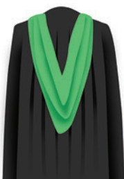
Creative Arts and Architecture Cendre Green