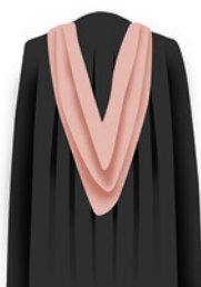
Health Sciences Eosin Pink

Graduates receiving a Professional Doctorate, PhD, Higher Doctorate, Doctor of Medicine or a Doctor of the University wear a bonnet of black velvet.