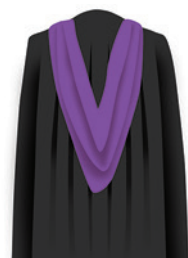
Engineering and related technologies True Purple