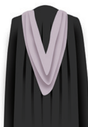
Society, Culture and Education Pale Violet Grey