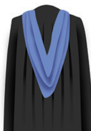
Business Helvetia Blue