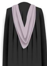
Society, Culture and Education Pale Violet Grey