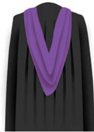
Engineering and related technologies True Purple