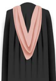
Health Sciences Eosin Pink