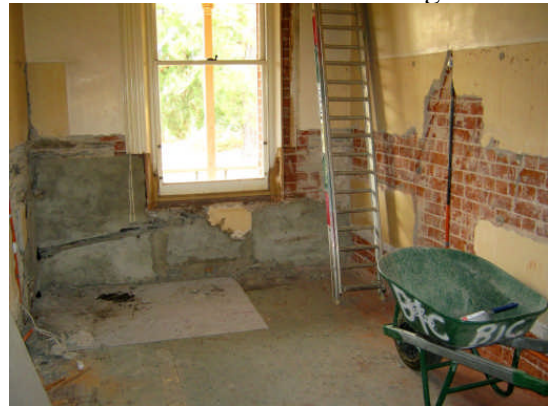
The former photocopying room ready for new plaster