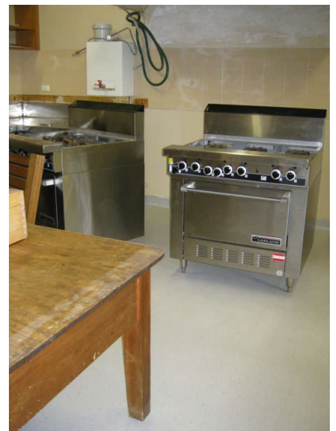
Right: The new kitchen floor