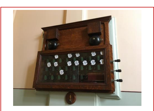
Servants' Bell System