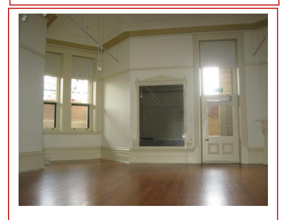
The Ballroom before and after restoration