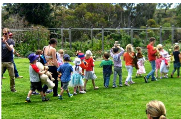
Grand Parade of Teddies and their owners