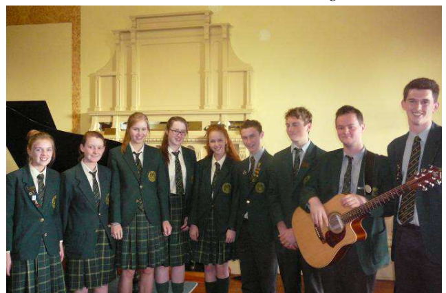
Mercedes College students