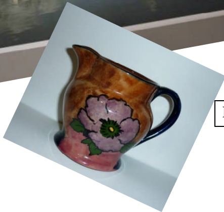
Examples of goods on offer

You may be familiar with the term “a win / win situation” – nothing could be more apt for this very successful event held at Urrbrae House during the Christmas function in 2010. There was a vast array of paintings and prints, new electrical items, vouchers and goods from businesses, some bottles of wine and a few ‘interesting’ items (including antiques) to bid on!