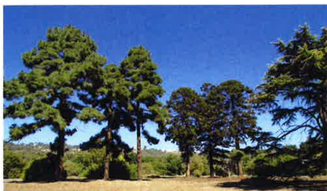
Conifers in the Waite Arboretum.

The Waite Arboretum has 2,300 specimens planted across 30 hectares. Each specimen has been selected and planted with the principle of no supplementary watering after establishment. This 'no watering' principle was designed to guide tree selection for plantings on the Adelaide plains.