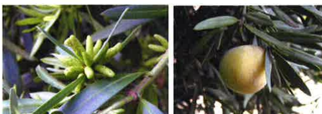
Male cone (left) female cone (right)

Yellowwood is a dioecious species, with male and female flowers on separate plants. The male cone is brown with spiralling scales and measures 5 to 15 millimetres long by 3 millimetres wide. It grows from the leaf axils. The female cone has one scale bearing one seed between one and two centimetres long. The gray-green seed is drupe-like with a woody coat covered in a fleshy, resinous skin. The Waite Arboretum has two Afrocarpus falcatus on the eastern boundary of the lake, both of which currently have some fruit. One has some large fruit, more than 20mm in diameter showing the thick fleshy outer covering. This pair of trees is separated by an Australian Podocarp – Illawarra Plum ( Podocarpus elatus ), which easily shows the similarities.