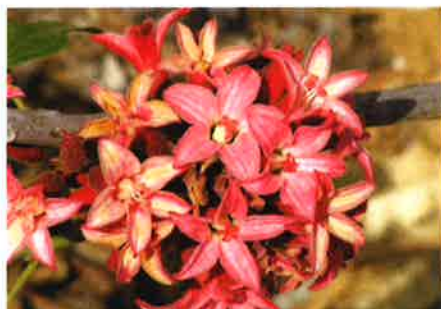
Brachychiton bidwillii , Little Kurrajong is a decorative small tree which drops its deeply lobed palmate leaves before flowering. As it ages the tree flowers more profusely eventually producing bunches of up to 50 flowers directly from the trunk as well as those on twigs and branches. Flowers are bell-shaped and vary in colour from orange-red to salmon-pink. Origin Queensland and NSW.