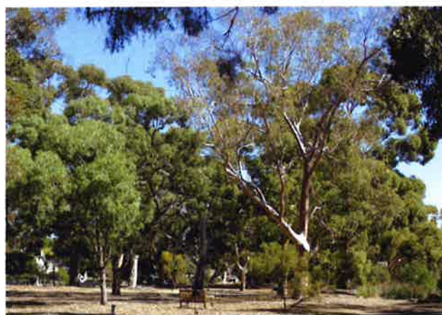
Eucalypts in the Waite Arboretum.

Arboreta became more popular in the western world as exploration and expansion into unfamiliar regions during the 18th and 19th centuries led to increases in plant collections – both living and preserved. The term "arboretum" was probably first used in the 18th Century. Curiosity and commercial interests were the primary drivers to the early arboreta.