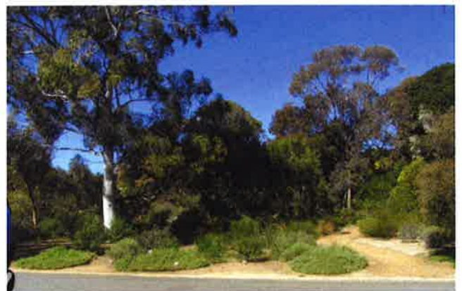
Mallee section with soil clear of mulch.

Immediately adjacent, across the road is the more extensive Mallee Section. Steve pointed out that considerable attention has been given to making the layout resemble as much as is possible what the real mallee association is like. This ranges from the actual surface of the low fertility sandy soil to the top of the tree canopy where in between, grasses and small shrubs grade up to the trees with the eye-catching variation in leaf size and shape and the grey/green shades of the vegetation.