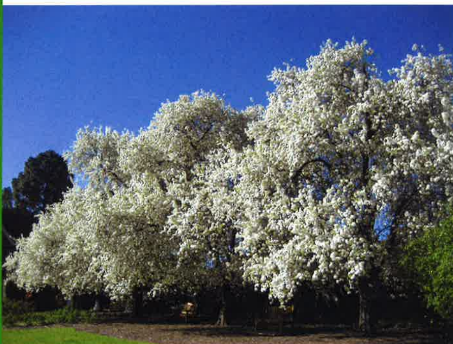
Pyrus calleryana in full flower this spring.