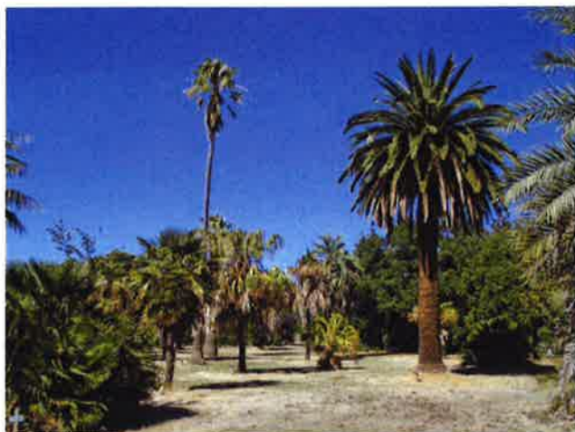
Palms in the Waite Arboretum.

The Waite Arboretum is a widely recognised part of a national network of significant arboreta.