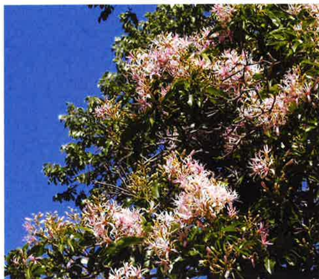
Example of image labelling: Calodendrum capense #933 FI M 27-6-14