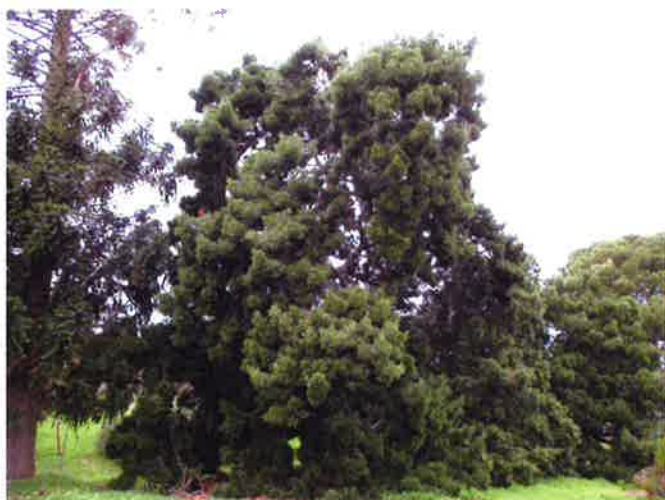
Afrocarpus falcatus in the Waite Arboretum.

Afrocarpus is a genus of conifers belonging to the podocarp family - Podocarpaceae. Prior to 1989 Outeniqua Yellowwood was known as Podocarpus falcatus .