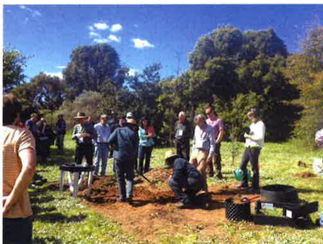
Planting a memorial oak in the Arboretum at Treenet.