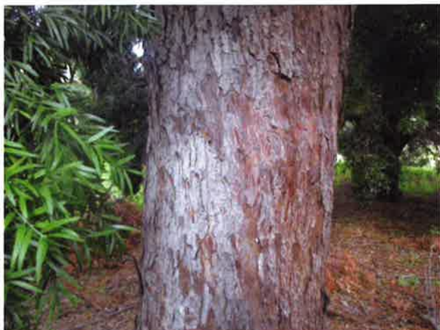
Afrocarpus falcatus bark.

The bark is interesting, being smooth and ridged on younger stems and peeling off in flakes on the older trees.