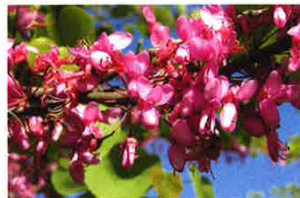
Cercis siliquastrum , Judas Tree has deep pink pea-like flowers which are borne in clusters along the branches and trunk before the spring foliage appears. In autumn the yellow leaves contrast with the chocolate brown seedpods. Origin S. Europe and W. Asia.