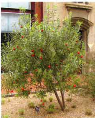
Quandong in Whipstick Mallee

First stop was the Whipstick Mallee along the front of the old tram barn, now the Plant Biodiversity Centre. Here the various plantings are now developing well since being established 10 years ago. The soil is introduced sandy loam with a covering of gravel, which acts as an ideal barrier for moisture retention. Several mallee Eucalypt species including the attractive pink or cream flowered E. kingsmillii and some Callitris glaucophylla grow as the upper story above Grevillea lavendulaceae , the rare Northern Flinders Daisy, Senecio megaglossus , Porcupine Bush, Triodia irritans and a selection of normal grasses. A single Quandong, Santalum acuminatum was fruiting well.