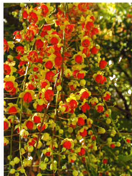
Cassia brewsteri , Leichardt Bean, is an attractive small tropical tree with pinnate leaves and, in spring, a stunning display of pendulous racemes of yellow and orange flowers. These are followed by brown seedpods up to 45cm long. Origin Queensland