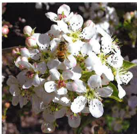
Pyrus pyraaster , Wild Pear (above and right), thought to be an ancestor of the cultivated European pear, bears hard, astringent fruit which are edible when fully ripe.