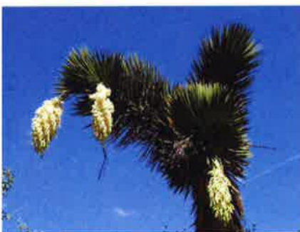
Yucca filifera is a fast growing, branching large yucca. Leaves are stiff, olive-green and form spherical heads at the ends of branches. It bears large cream inflorescences of bell-shaped flowers. Origin Mexico.