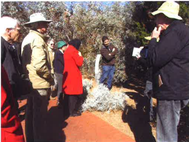
Friends in the Whipstick Mallee.