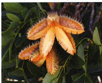
Flindersia australis , Crows Ash has large inflorescences of cream flowers (below) which develop into woody capsules (above) each carrying a winged seed. Origin Australia