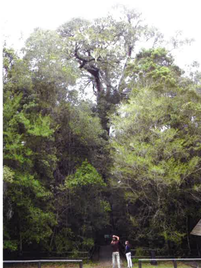
One of the remaining 'giant' Podocarpus falcatus in the Outeniqua forest near Knysna, South Africa.

Afrocarpus falcatus is a tall evergreen conifer often growing up to about 45 metres tall, but known to have reached 60 metres. At higher elevations and in exposed, coastal habitat it rarely exceeds 25 metres tall. The trunk can be 2 to 3 metres wide. Yellowwood is one of the tallest and largest trees in South Africa, and some have been designated by the Department of Water and Forests as Champion Trees, including the Eastern Monarch at 39 metres. Of interest, the tallest tree in South Africa is a Sydney Blue Gum ( Eucalyptus saligna ) at 79 metres. Afrocarpus includes the largest known podocarps outside of New Zealand where Totara ( Podocarpus totara ) is substantially larger. The tree was heavily exploited in earlier days and the 'giants' were felled for timber, thus the lack of large trees and therefore its protected status today.