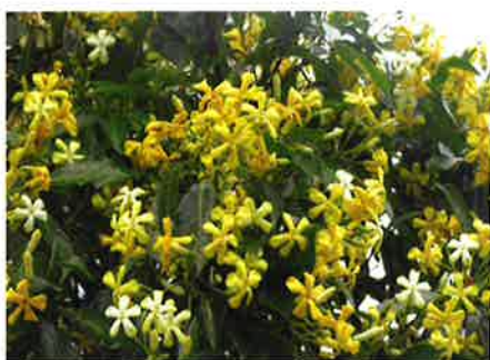
Hymenosporum flavum , Native Frangipani has sweetly scented flowers which open cream and age to a rich yellow. Fruit capsules are hard and brown, containing numerous closely packed layers of brown, papery seeds. Origin Queensland, NSW, New Guinea.