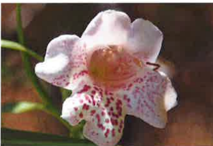
Eremophila bignoniiflora , Bignonia Emu-bush has large flowers and is bird pollinated. Origin Australia.