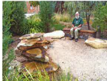
Water feature and gabion seat in the Garden of Discovery.

Bees are other categories of interest that are frequently seen in the Arboretum. Submitting your images will enable scientists to analyse not only occurrence but also population densities that may vary seasonally and from one year to the next. I encourage Friends to participate in this exciting initiative.