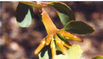
Eucalyptus platypus , Moort, is notable for the flattened peduncle which supports the inflorescence of up to 7 stalkless buds. Origin WA.