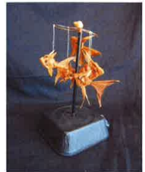
Sylvia Piddington, 2014, Fish Bowl with Fish (25 x 25 x 32 cm), bowl worked as lace half stitch a mirror image of hexagonal weave) using Dracaena draco and fish woven from Philodendron leaf sheaths with bead eyes.

Non-Waite Arboretum plants (African Flag, Chasmanthe floribunda , New Zealand Flax, Phormium tenax and cultivars), and non – plant / manufactured materials (telephone wire, barbed wire, ...), can be used – as well as feathers, shells, and clothing etc.