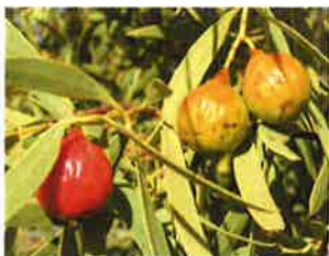
Quandong fruit in the Adelaide Botanic Garden

Huge Quandong tree at Wirrabara. This is probably the best known species growing naturally in South Australia, having a wide distribution from coastal dunes to granite outcrops in the drier inland areas. The tree grows to about 6 metres high, has pale green leaves up to 9 cm long, profuse flowers and eventually, spherical, bright red fruits up to 45 mm in diameter. The fruit forms a fleshy covering (mesocarp) over a round kernel which like other species is pitted. The flesh is easily peeled and can be eaten raw but is usually made into jellies, jams and chutneys. Quandong is probably our most sought after "Bush food".