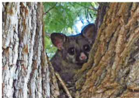
Australian native Brush-tail Possum in one of the Elm trees in Elm Avenue.