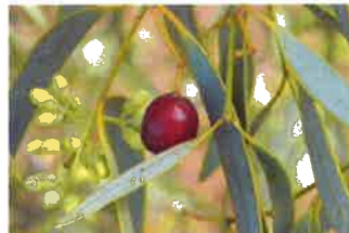
S. lanceolatum fruit in the Waite Arboretum

S. lanceolatum – Northern Sandalwood, Plum Bush.