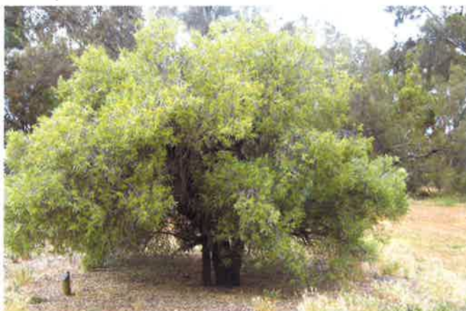
Alectryon oleifolius ssp. canescens . Arboretum specimen #279, planted in 1959. Nearby are two younger specimens

Bullock Bush is widespread in the drier parts of Australia. There are three subspecies: ssp. canescens , common in SA on limestone-sand soils; ssp. elongatus a taller plant with greener longer leaves found in western NSW on heavier soils; and ssp. oleifolius found in northern WA.