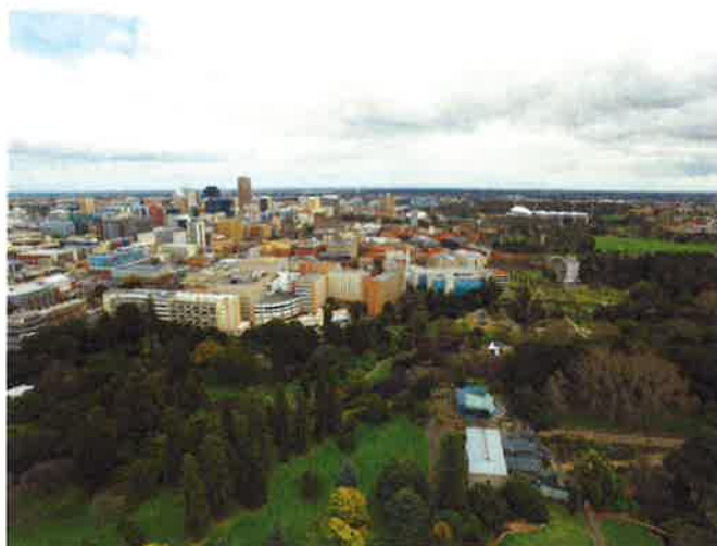
Drone's-eye view of the Adelaide Botanic Garden – Day Two TREENET Symposium 2015.

As an annual community education and professional development exercise, TREENET hosts a two-day National Street Tree Symposium in the first week in September; the 16 th such event held at the National Wine Centre and Adelaide Botanic Garden being the most recent.