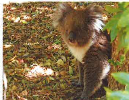
Koala resting in the deep shade of an exotic tree.