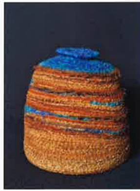
Lyn Coombe, 2012, Ripple ; Lamia Guscia, 2012, Landscape , dyed blue and natural palm inflorescence.