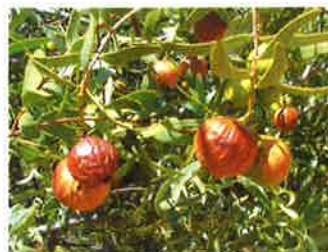
S. spicatum fruit.

S. obtusifolium – A rarely cultivated species. It has quite a different habitat from the others which are mainly arid land types. Its habitat is along the eastern coast from southern Queensland to north east Victoria. Unlike other described Australian species, the leaves are rounded and have recurved leaf margins.