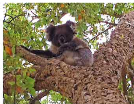
Koala in Quercus suber , Cork Oak. With the hotter drier weather, native animals are often seen in unexpected places in the Arboretum.