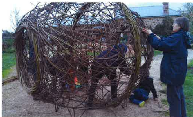
Random weaving of grape vine and willow , 2015.