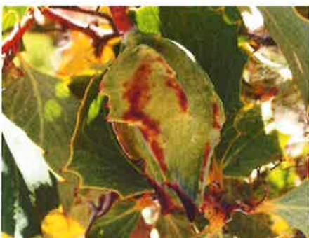
Hakea cristata fruit has a toothed crests along either side of the suture. Fruit is well-camouflaged among the toothed foliage. Origin WA.