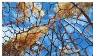
Basketry SA, 'Bamboo Hive' 2015, in 'Little Sprouts Kitchen Garden' Adelaide Botanic Garden.