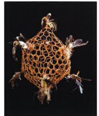
Sylvia Piddington, 2010, Bird Flu Virus Mobile (30 x 30 x 40 cm) 'mobile worked by twisting Chasmanthe floribunda , with added feathers. The virus is represented with an hexagonal protein structure and the feathers represent the antigenic groups. The nucleic acid is absent'.