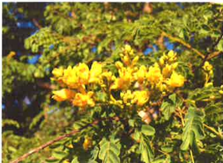
Caesalpinia ferrea , Leopard Tree has beautiful mottled bark, attractive bipinnately compound leaves and bright yellow flowers in summer. Origin Brazil.