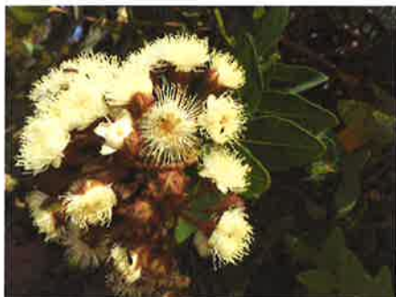
Angophora hispida, Dwarf Apple. Angophora flowers have petals as well as stamens other eucalypts. Origin NSW.