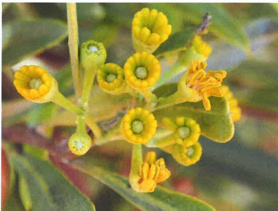
Alectryon oleifolius ssp. canescens , Bullock Bush