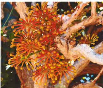
Stenocarpus sinuatus , Firewheel Tree. Each inflorescence has 12-15 individual flowers. Origin NSW, Qld.