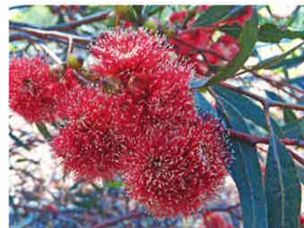
Eucalyptus 'Urrbrae Gem' discovered at the Waite Arboretum in 1956, is thought to be a hybrid of E. erythronema x E. stricklandii .