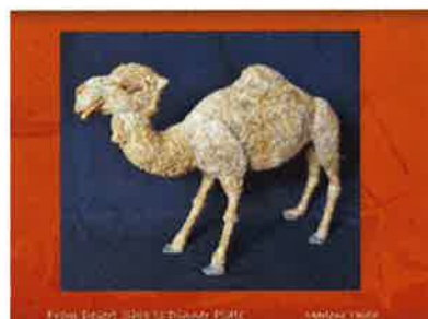
From Desert Ship to Dinner Plate , 2012, Marlene Thiele, Cobbled grass over a wire frame, Photo Maxwell Madgin.