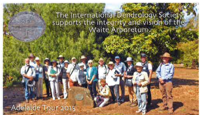
Part of the IDS group by the bronze plaque which is one of only two in Australia awarded by IDS.

On 21 October I gave a presentation in Mt Gambier to the Australian Forest History Society Conference held every four years.