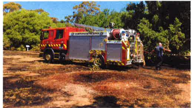
The Fire Brigade on site.

On 21 October I gave a presentation in Mt Gambier to the Australian Forest History Society Conference held every four years.