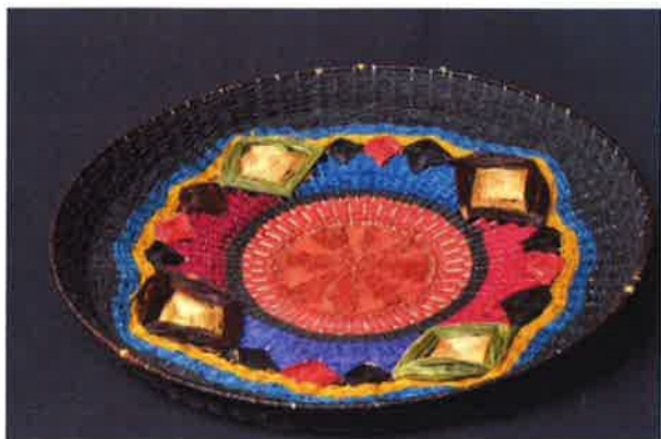
Colour Whirl , 2012, Anne Quigley metal fan frame, woven plant and clothing materials.

Designing and planning a basketry project will often depend on the material and, technique chosen. Techniques of stitching, shaping, twining, and weaving can govern the size, design, detail and function of a work. Spontaneous – free form basketry can be seen as choosing a material and at times allowing the material's specific characteristics to strongly influence the outcome.