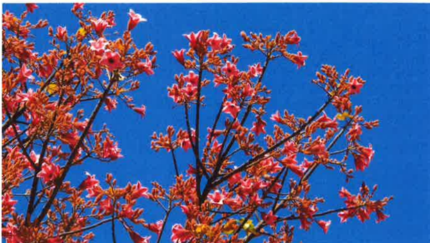
Brachychiton discolor , Lacebark Tree flowers profusely. Seed is carried in large pods and is surrounded by irritant hairs. Origin NSW, Qld.