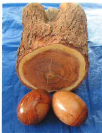
Santalum spicatum showing heartwood.

Western Australia currently has the largest sandalwood plantation resource in the world. Australian sandalwood is being grown in commercial plantations throughout the Wheat-belt of Western Australia, and Indian sandalwood in the tropical far north of WA mainly in the Kununurra region within the Ord River Irrigation Area. Recent developments have seen plantations set up in the Darwin area, near Katherine and in the Douglas Daly region of Northern Territory. Plantations are also being set up in the Burdekin area of northern Queensland.