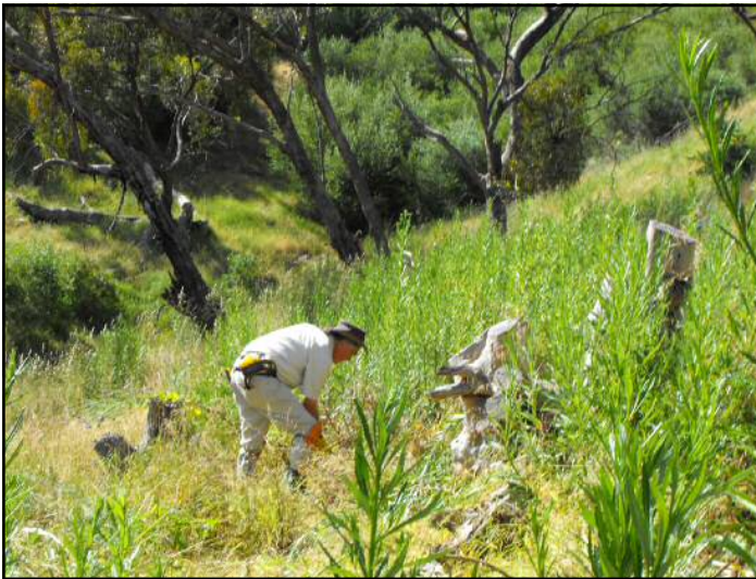
Noel Nicholls doing battle with South African Daisy in Wild Dogs Glen

Most time was spent controlling many thousands of olive seedlings and some larger olives. Although we didn't quite re-visit the entire reserve, we were able to concentrate on the worst bits including some problem areas missed in previous years. These included Netherby Gully, the lower slopes of Pultenaea Hill and eastern Urrbrae Ridge.