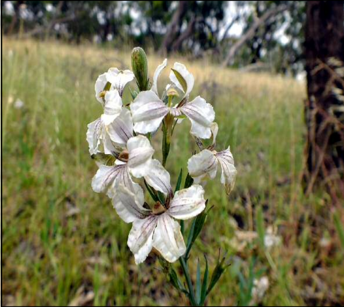
White Goodenia Goodenia albiflora

The White Goodenia ( Goodenia albiflora ) is known from only a few locations in the reserve. It is a species whose distribution is restricted to the Adelaide region and whose status is listed as uncommon. On a positive note, it is an easy species to reproduce from cuttings.