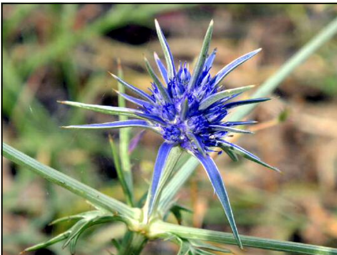
Blue Devil Eryngium ovinum

Late Spring and summer is also flowering time for the Blue Devils ( Eryngium ovinum ) in the Reserve.