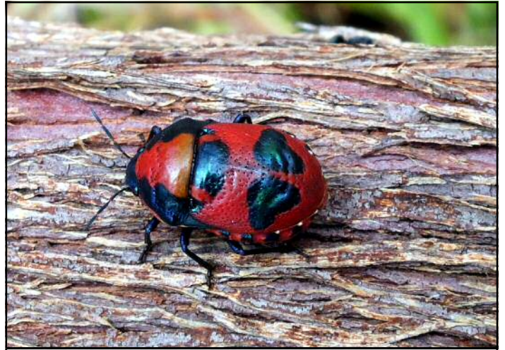
Ground Shield Bug ( Choerocoris paganus ).

Agrilus is a herbivore, with the larvae feeding on the outer wood (cambium) of Golden Wattles.