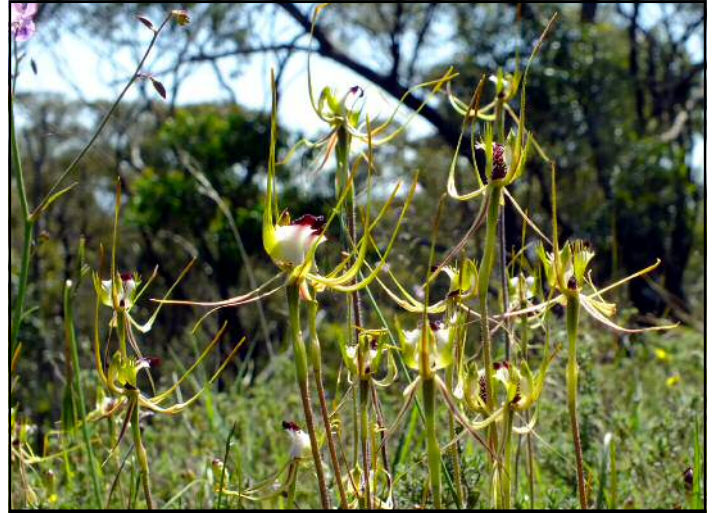
King Spider Orchid, Caladenia tentaculata

This spring was a good one for some species of orchid, King Spider orchids did particularly well both in the number of flowering plants and the length of flowering season. It pleasing to see on a recent visit that many had been successfully pollinated thus insuring a continuing population.