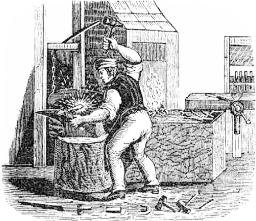
Strike while the iron is hot