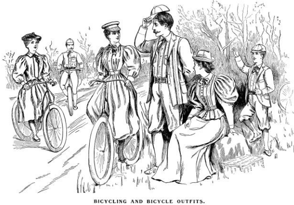
BICYCLING AND BICYCLE OUTFITS.

Please aim to keep carry bags to a minimum. While in the house, students' belongings ("luggage" in 1892) such as bags, drink bottles and school hats will be stored on a trolley in a rear storeroom of Urrbrae House. These will be returned to students in the Main Hall at the end of their visit.